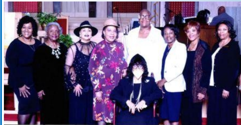
Carter Metropolitan CME Church Evangelist "2023"

Our commission for Evangelism outreach is "EACH ONE REACH ONE"