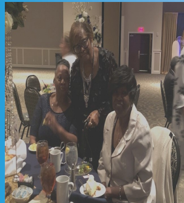
Members of Carter Metropolitan attended the 3rd Annual CME Empowerment Banquet in Tyler, Texas.